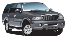
Sport Utility Vehicle