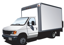
Refrigerated Truck (0-60k)