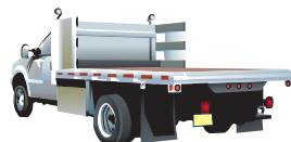
Flatbed Truck (0-60k)