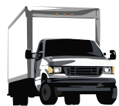
Straight Truck (0-60k)