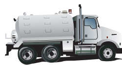
Tank Truck (< 2,000 gal)