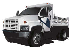
Dump Truck (0-60k)